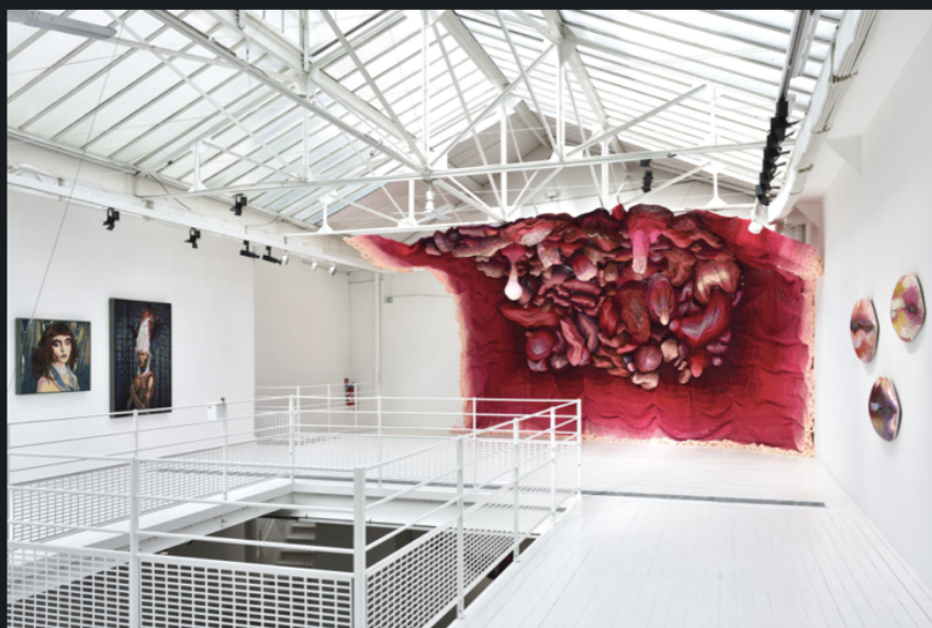
Intallation views of Frances Goodman's Red Runs Through at Gallery les Filles du Calvaire

South African artist Frances Goodman takes over the gallery Filles du Calvaire for the first time with her solo show "Red Runs Through" . Until April 20, 2024 , the exhibition space is decked out in a reddish hue in perfect harmony with the works on show. This vibrant color eloquently reflects the themes underlying Frances Goodman's artistic practice, such as power, vitality and femininity.