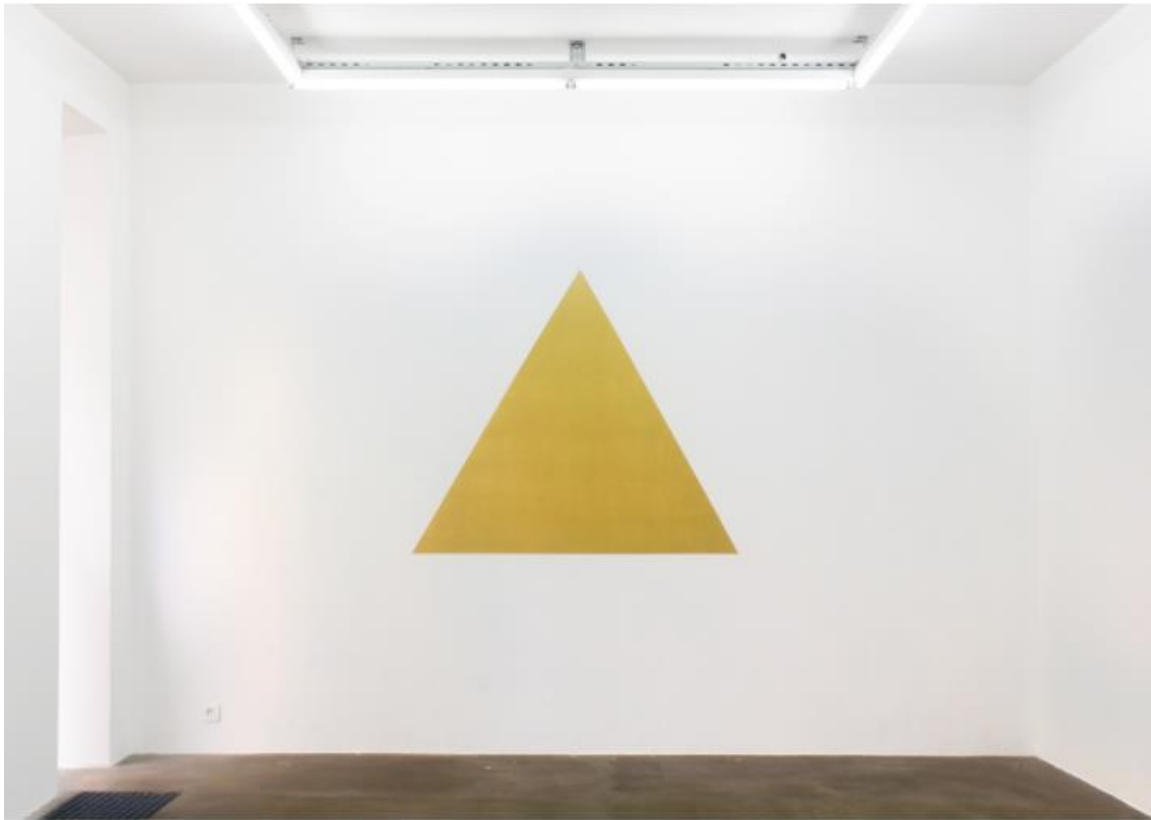
Olivier Mosset, The Golden Triangle , 2007, Wall painting, 60 x 60 in - REF/MOSS1708