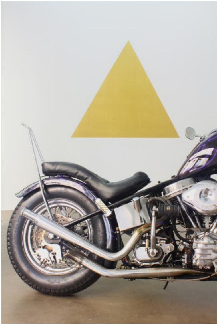
Installation view, TORRI, Paris