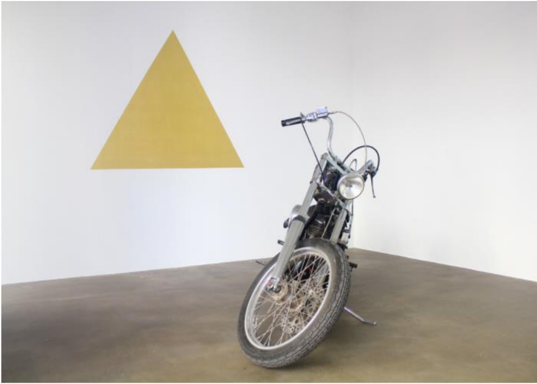
Installation view, TORRI, Paris