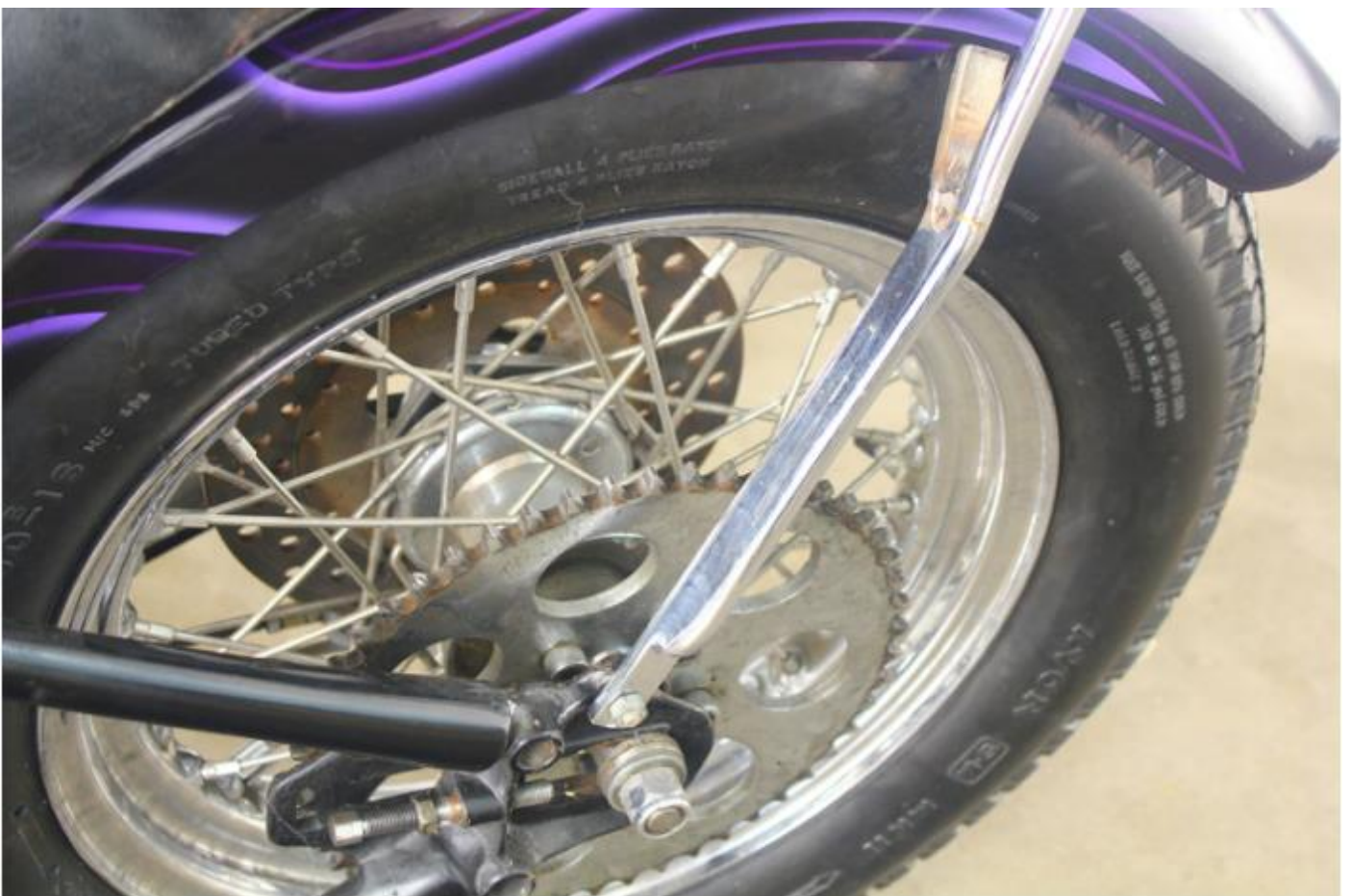
Harley Davidson, Panhead (1958), 1200cc (detail)