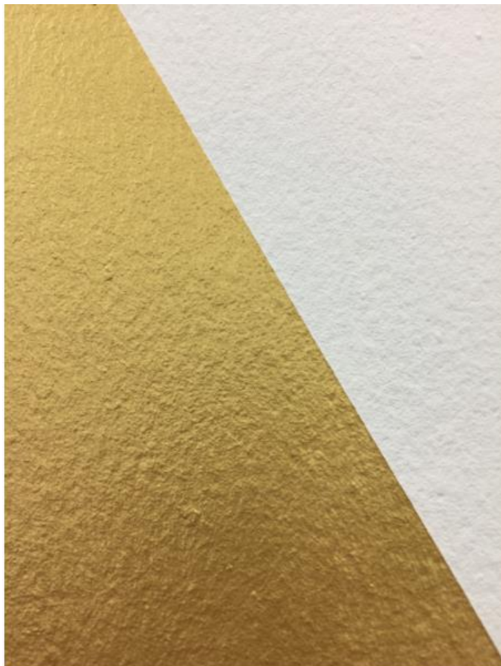
Olivier Mosset, The Golden Triangle, 2007, Wall painting, 60 x 60 in (detail)