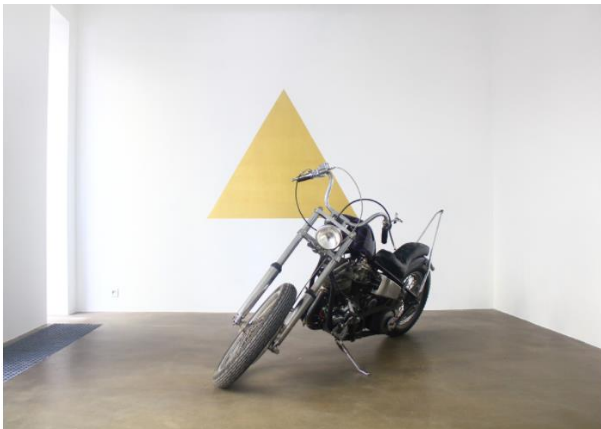
Installation view, TORRI, Paris