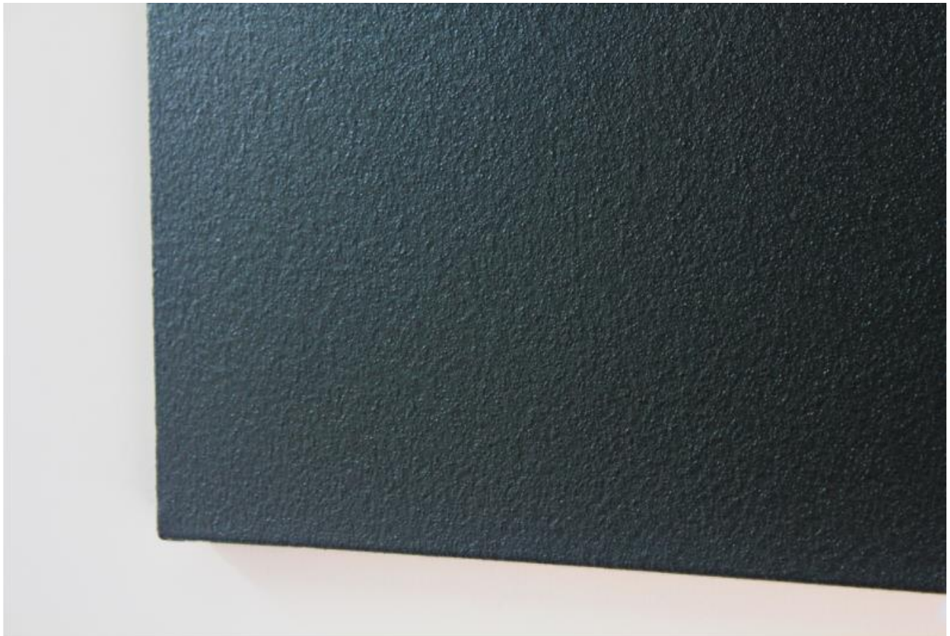
Olivier Mosset, Untitled , 2007, Polyurethane on canvas, 122 x 122 cm (detail)