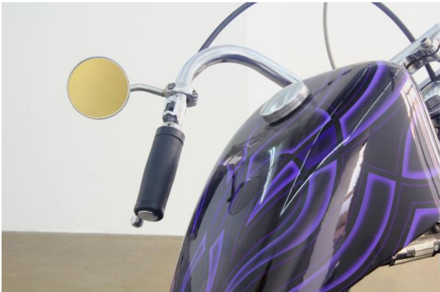
Harley Davidson, Panhead (1958), 1200cc (detail)