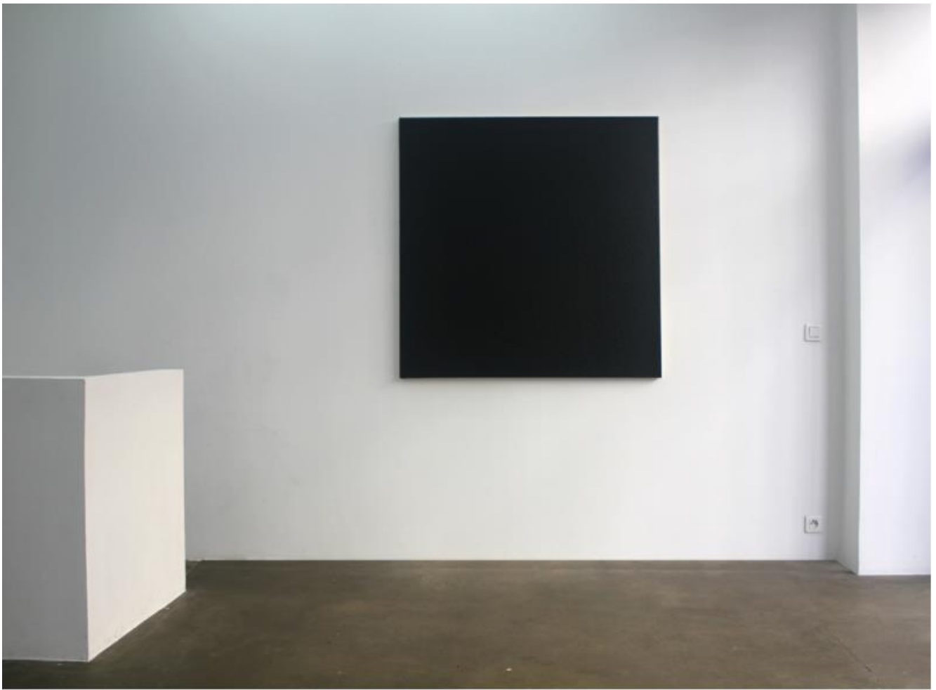
Olivier Mosset, Untitled , 2007, Polyurethane on canvas, 122 x 122 cm - REF.MOSS1706