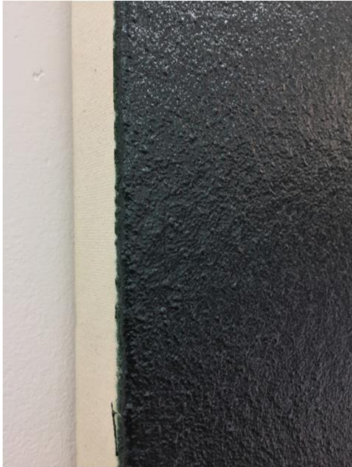
Olivier Mosset, Untitled, 2007, Poljuretane on canvas, 122 x 122 cm (detail)