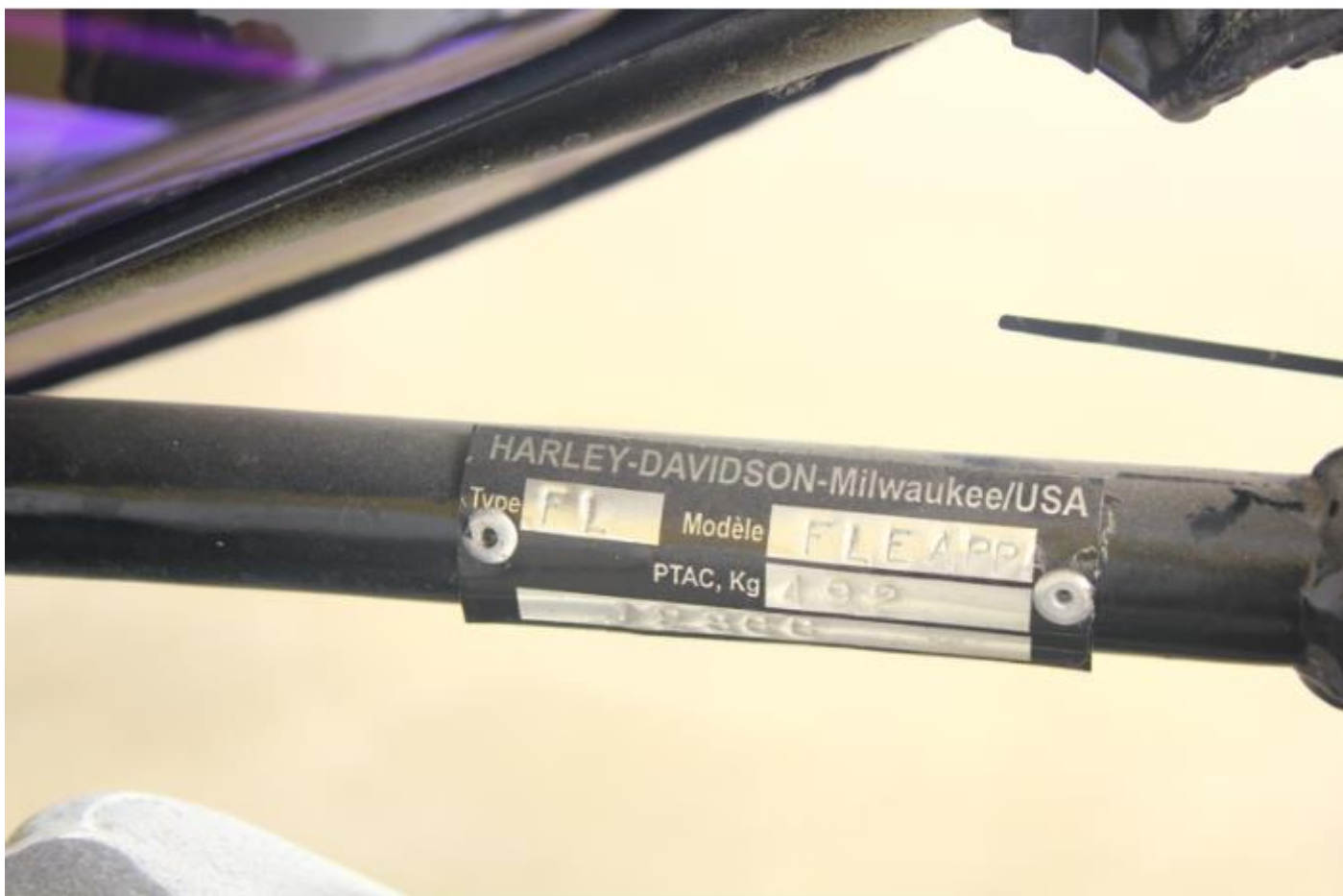
Harley Davidson, Panhead (1958), 1200cc (detail)