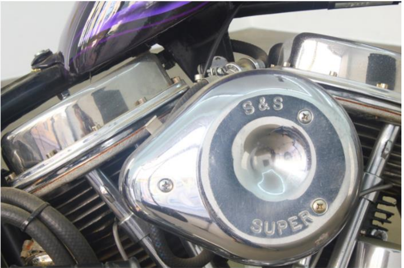
Harley Davidson, Panhead (1958), 1200cc (detail)