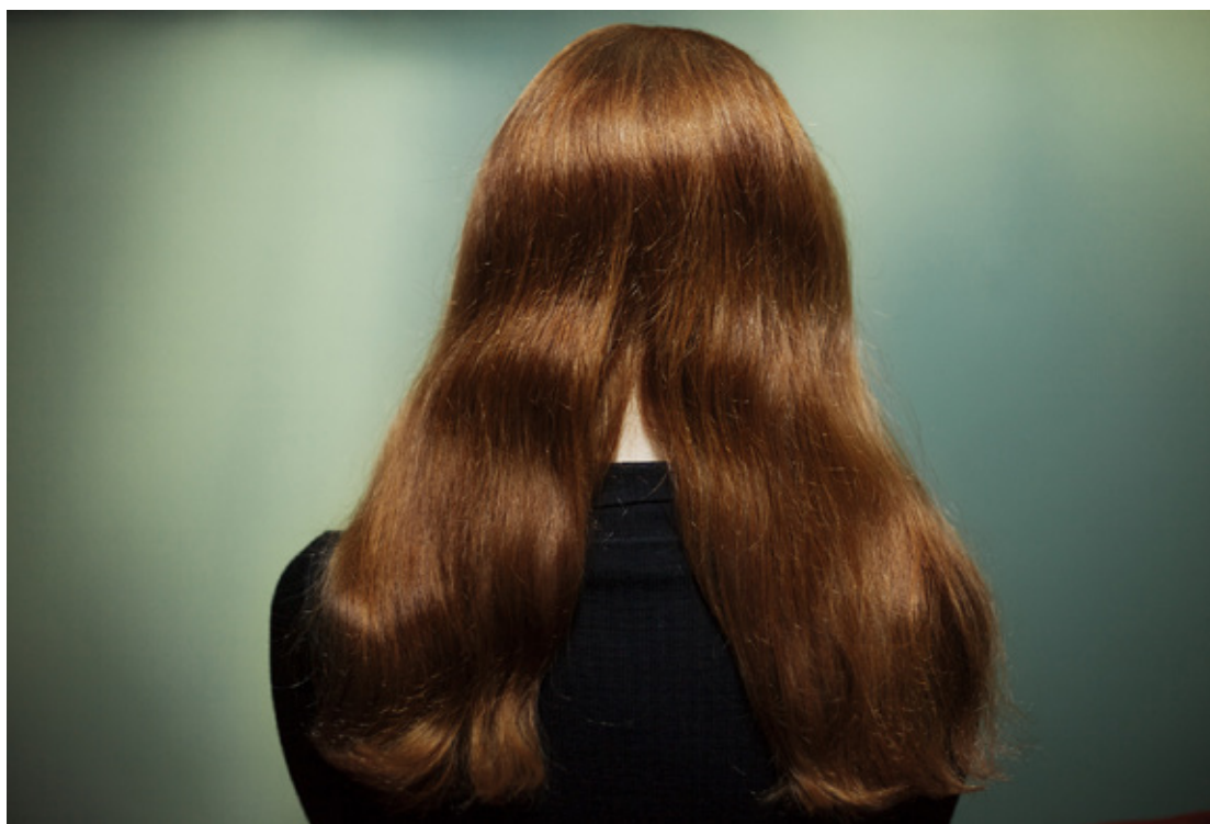
Pyramid I, 2013