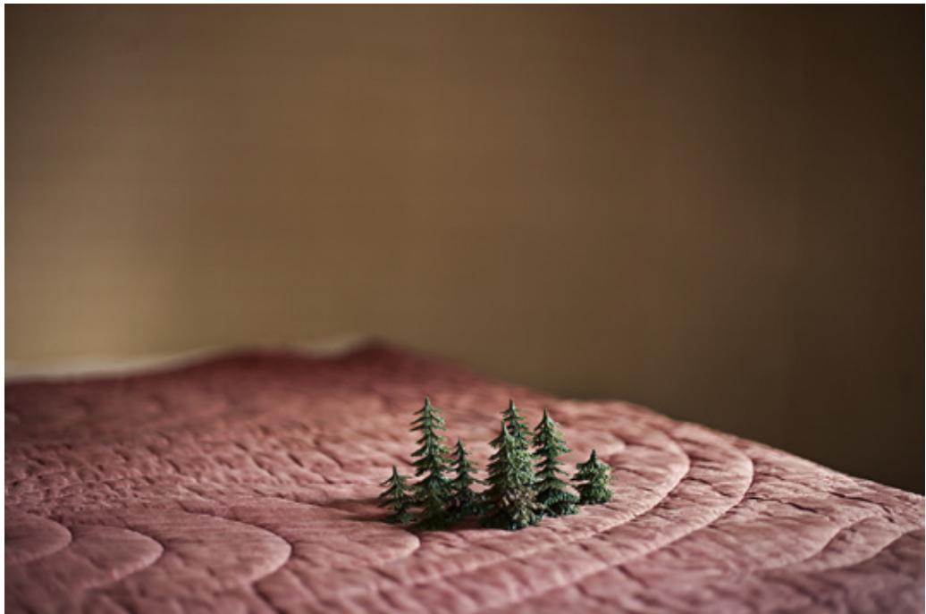
Small forest, 2014

For me photographs are like fixed points in the process of change and alteration. They open up for observation and they allow the viewer to step closer. One can gather trust and confidence in recognizing something in them, but simultaneously, photographs have another kind of nature – a side turning towards the invisible and the unidentified. What finally becomes recognized can be something “outside” the image, something out of sight – something imperceptible. In this momentary experience, something is revealed. It is not something “thathasbeen”, but rather something that exists and is present here and now.