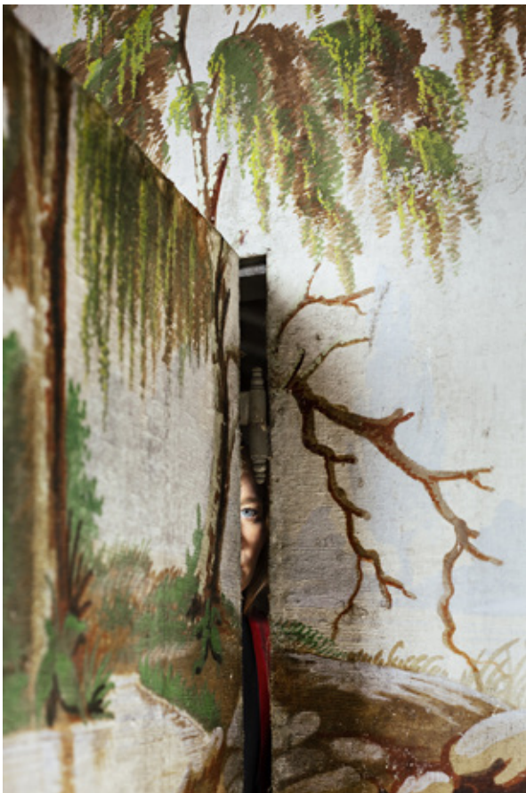
Pyramid li , 2013